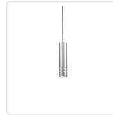
494502M-BN Brushed Nickel